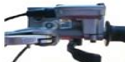
Throttle cable/ Front & rear brake lever pivot