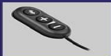
Illuminated 3-key remote control