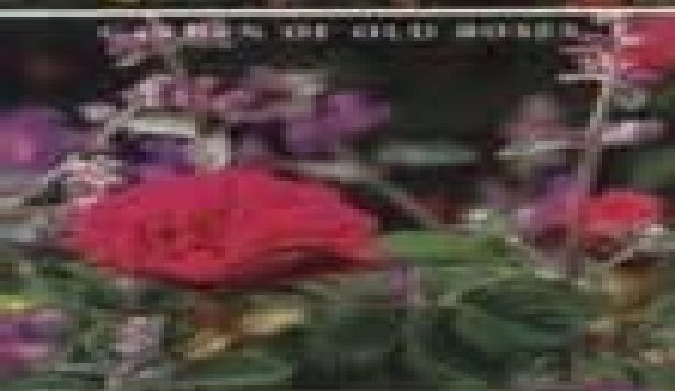
GARDEN OF OLD WISDOM