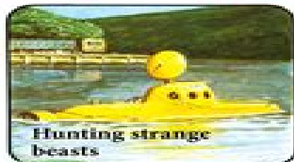
Hunting strange beasts